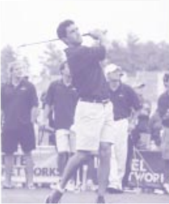
The Jimmy V Celebrity Golf Classic

November, 1999 – Golf Magazine following his participation in The Jimmy V Celebrity Golf Classic