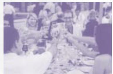
The V Foundation Wine Celebration

Olympic Champion Ice Skater following her participation in The V Foundation Wine Celebration